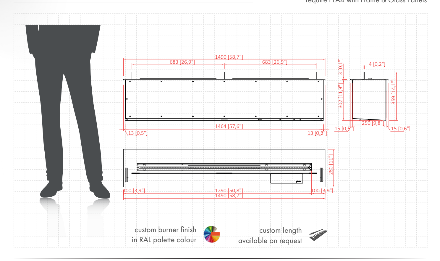
Freestanding, Room Divider, Tunnel and Island housings require FLA4 with Frame & Glass Panels

All product specifications and data are subject to change without notice and are believed to be accurate as of the date hereof. Planika Sp. z o.o., its affiliates, ogents, and employees, and all persons acting on its or their behalf (callectively, "Planika Sp. z o.o."), disclaim any and all liability for any errors, inaccuracies or incompleteness contained in any document or in any other disclosure relating to any product. To the maximum extent permitted by applicable law, Planika Sp. z o.o. disclaims any and all liability arising out of the application or use of any product. No license, express or implied, by estoppel or otherwise, to any intellectual property rights is granted by this document or by any conduct of Planika Sp. z o.o.. Customers using or selling Planika Sp. z o.o.'s products not expressly indicated for use in such applications do so entirely at their own risk and agree to fully indemnify Planika Sp. z o.o. for any damages arising or resulting from such use or sale. The provided fuel consumption is based on laboratory testing on the lowest flame level. The actual consumption of individual devices may vary. The images are indicative only.